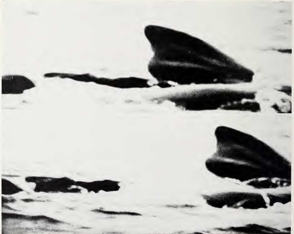
Fig. 7 (above) and 8 (below). Two frames from a ciné-sequence show the final phases of a sweep with the flipper as the active whale moves past the head of its passive partner

times rolled it completely over. On occasion, this activity ceased with the head of the initiating whale resting on the dorsal surface of the passive partner (Fig. 6). There were many variations, for example, when the initiating animal thrust directly at the flank of the passive partner or when it slid slowly beneath the ventral surface, sometimes inverting as it did so. Further, the angle of approach varied, and contact was established at different points along the axis of the body of the passive whale.